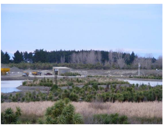
Indigenous biodiversity amongst a quarry operation

A sticking point for some members of the Hurunui community was that "drawing lines on maps" would lead to substantial areas of their land being locked away from them, out of their control, with unduly, restrictive regulations imposed on them. It will be critical to manage these negative misconceptions and offer clarity on how the SNA process will affect landowners. This also needs to go hand-in-hand with the provision of information on what support and incentives will be available when SNAs are identified on private land. The NPSIB already states this, but it may be difficult to implement in the timeframes suggested, especially in districts like Hurunui.