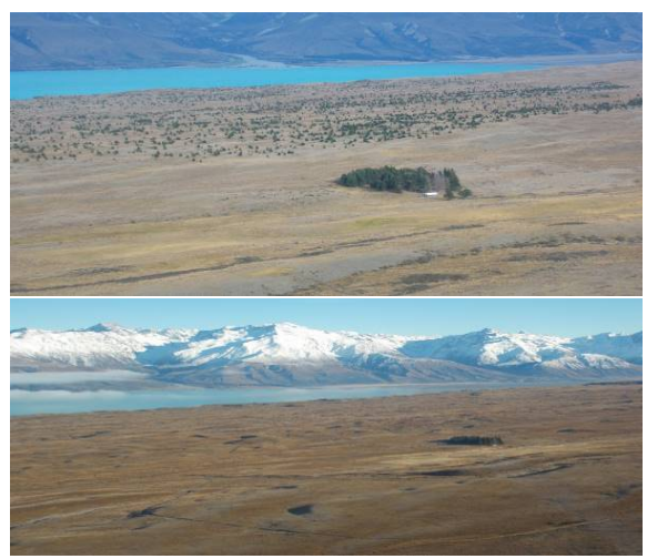
Mackenzie Basin: Before and after wilding conifer control

The programme recognises that a critical factor for success is building strong partnerships between community landowners, groups, industry, researchers, local and central government. At the centre of partnerships is buy-in and ownership; the desire to do it for yourself, not just because you are told that you must. Landowners are the ones doing the work on-the-ground, and they need to be part of the process from the beginning. The Wilding Conifer Control Programme achieve this by ensuring that all the players involved in implementation sit around the governance table. They have a shared vision, and all understand the role they play as well as gaining confidence that others are also fulfilling their roles.