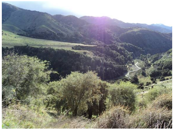
Areas of scattered bush amongst farmland in Hurunui are going to be particularly challenging to identify and map, particularly in the back country

listing of sites, there was significant resistance from others. Some parts of the community organised themselves to strongly oppose the identification of significant indigenous vegetation and any regulations relating to biodiversity on private land. It was, and still is, their view that the protection of indigenous biodiversity and ecosystems should be voluntary, and they do not support a regulatory approach.