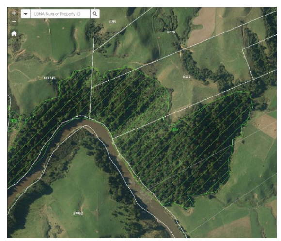
Photograph from online public viewer for likely SNAs

All of these measures have cost NPDC time and effort, but the results speak for themselves - landowners have been brought along with the process. There were no short-cuts when building relationships.