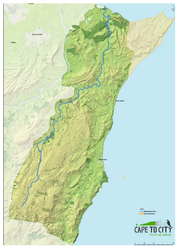
Cape to City project area

As a result of the success of Cape to City, another project Whakatipu Māhia was initiated in 2018. Whakatipu Māhia is an additional 14,000 ha of ecological restoration, possum eradication and predator control in the Hawkes Bay region being delivered in close partnership with Iwi and the farming community.